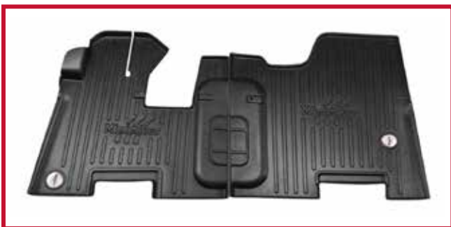
Figure 4 - Floor Mat Kit 105037