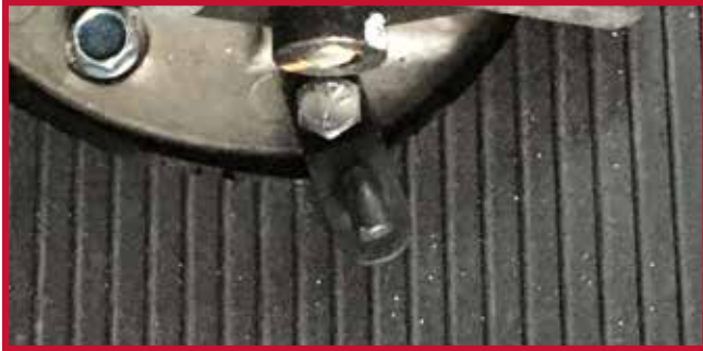
Figure 13 - Retention Hook & Hardware

11. Place the driver mat in the truck and attach mat to the retention hook.