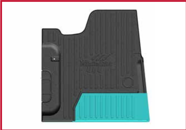
Figure 9 - Trimming Diagram