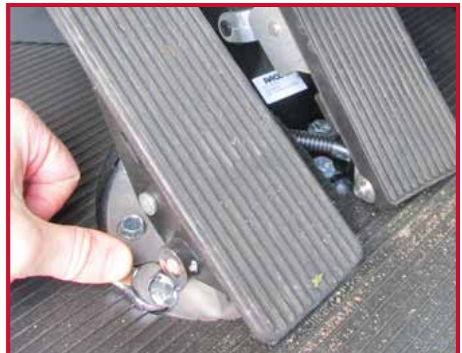
Figure 12 - Brake-Pedal Mounting Bolt