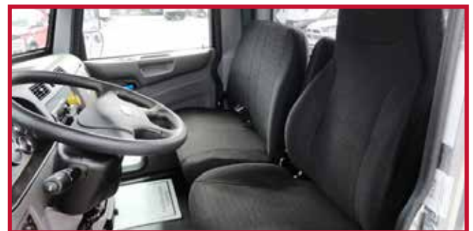
Figure 7 - Two-Man Bench Seat