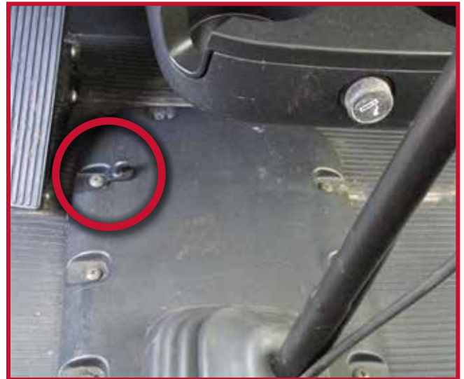
Figure 15 - Brake-Pedal Mounting Bolt

17. Prior to operating the vehicle, read the Safety Instructions for Vehicle Operation.