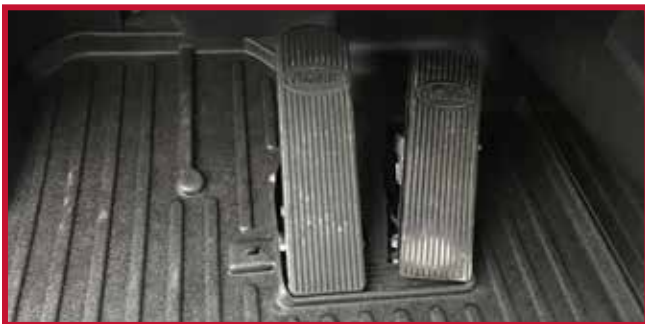
Figure 14 - Driver Mat Installed with Hook

12. Pull on the driver mat to confirm that the hook is fully engaged in the mat. If the hook is not functioning properly or the mat cannot be securely installed, do not use a Minimizer floor mat on the driver side of the vehicle.