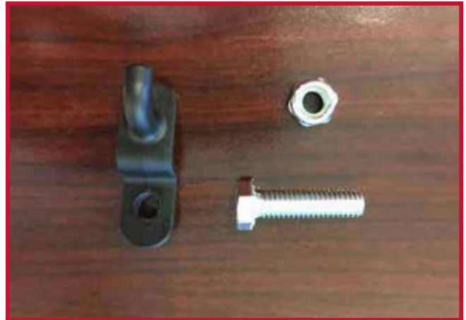
Figure 11 - Retention Hook & Hardware