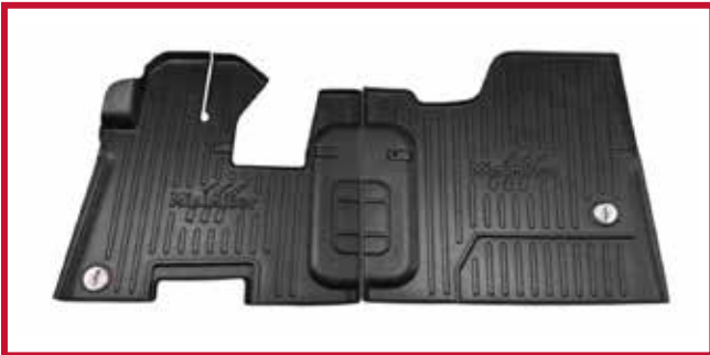
Figure 10 - Floor Mat Kit 105039