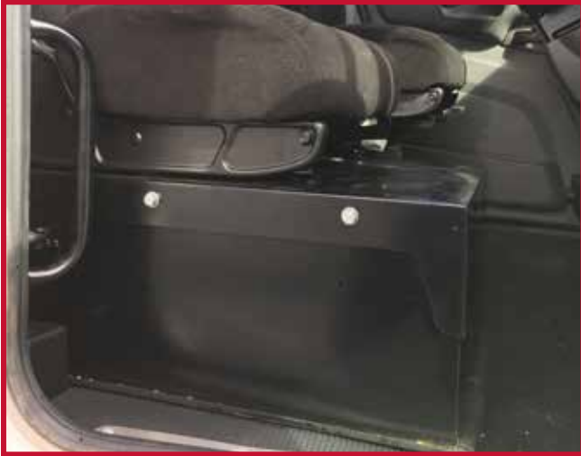
Figure 8 - Battery Box Passenger Seat Base