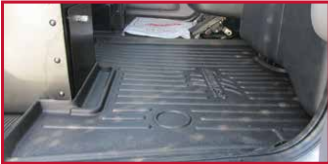
Figure 2 - Passenger Seat with Storage Compartment