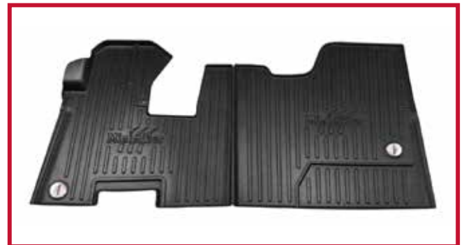
Figure 6 - Floor Mat Kit 105038