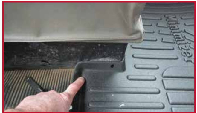
Figure 10 – Driver Mat Hook Location

• The retention hook will be attached to the right side of the driver seat base via a slotted hole in the vertical wall of the driver mat as shown Figure 10.