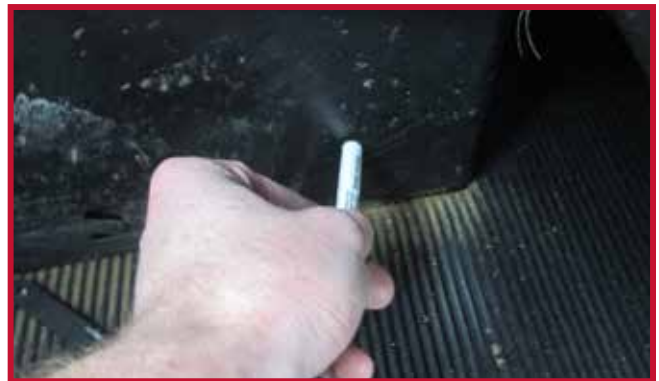
Figure 11 – Apply Primer to Seat Base

• Allow the Primer 94 to dry on the seat base surface for 5 minutes.