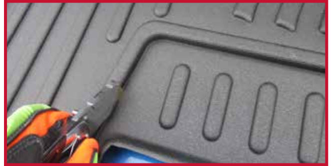
Figure 15 – Trimming Passenger Mat

13. Install the passenger mat retention hook. Apply primer to the area shown in Figure 16 and repeat step 7b above to properly attach the hook to the plastic door threshold. Figure 17 shows a proper hook installation.