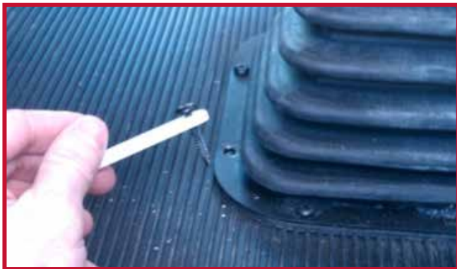
Figure 9 – Install Hook on Existing Screw

• Replace the screw in the original hole and tighten. Orient the floor mat hook so it points toward the front of the truck.