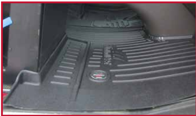
Figure 13 – Passenger Mat Fit

• If the truck is equipped with a passenger seat with under seat battery storage as shown in Figure 14, the passenger mat must be trimmed in order to fit properly.