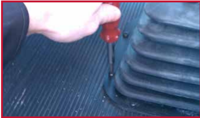
Figure 8 – Remove Screw from Shifter Boot

• Insert the screw through the hole in the retention hook as shown in Figure 9.