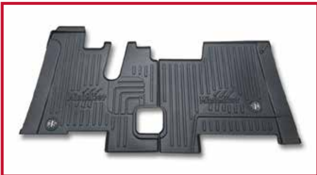
Figure 4 – Floor Mat Kit #100889