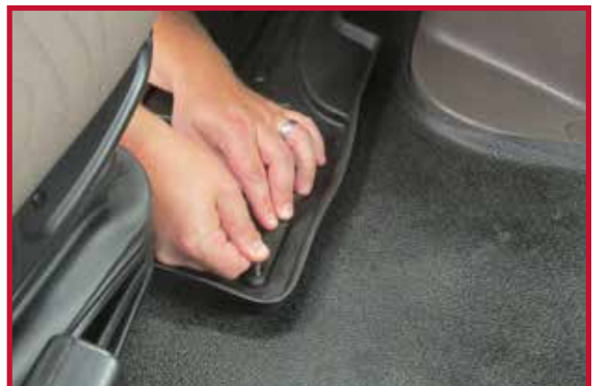
Figure 12 – Apply Pressure to Hook

• For optimal adhesion, do not disturb the hook for a period of 20 minutes after installation.