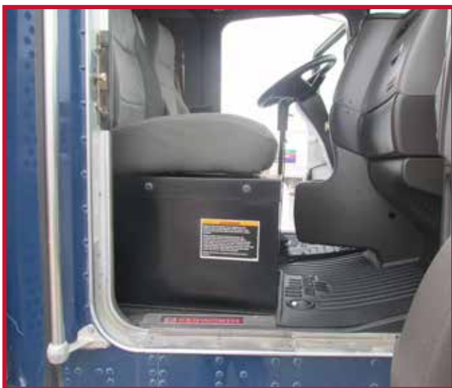
Figure 14 – Passenger Seat Battery Box with Trimmed Floor Mat

• Use a sharp utility knife to cut the mat. Follow along the inside edge of the tall rib and preserve the rib for liquid containment purposes. See Figure 15.