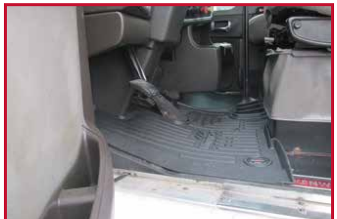
Figure 7 – Driver Mat Fit