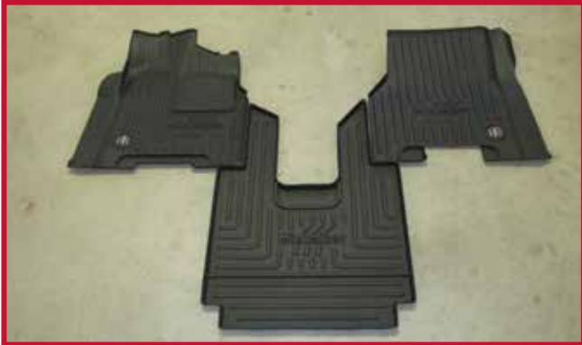
Figure 1 - Kit FKFRTL3MB Contents