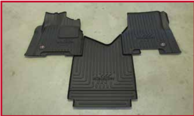
Figure 2 - Kit FKFRTL3AB Contents