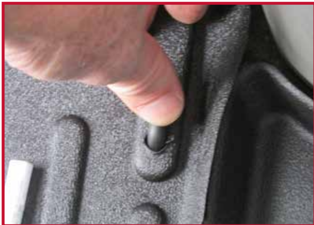
Figure 10 - Apply Pressure to the Hook