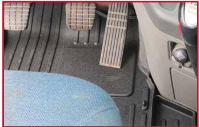
Figure 11 - Properly Installed Driver Mat and Hook