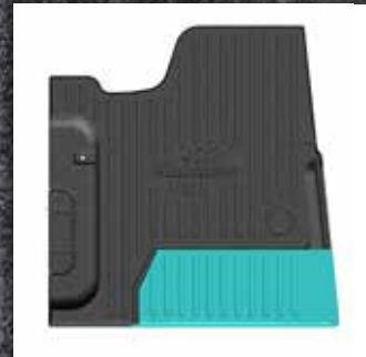
Figure 9 - Trimming Diagram