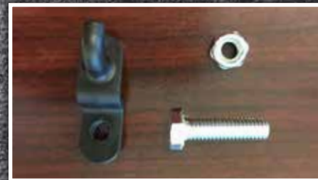
Figure 11 - Retention Hook & Hardware

8. Figure 12 below shows the location of the brake-pedal mounting bolt where the driver mat retention hook will attach to the truck floor.