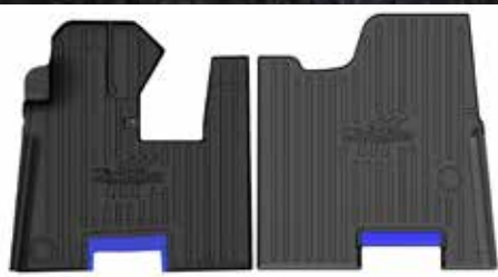
Figure 3 - Trimming Diagram