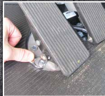
Figure 12 - Brake-Pedal Mounting Bolt

9. Remove the nut from the 5/16-18 x 1" bolt using a ½" socket and open end wrench. The nut is accessible on the bottom side of the cab.