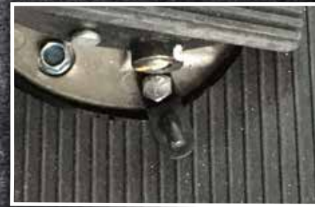
Figure 13 - Retention Hook & Hardware

11. Place the driver mat in the truck and attach mat to the retention hook.