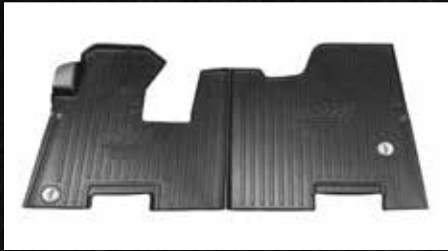
Figure 1 - Floor Mat Kit 105036