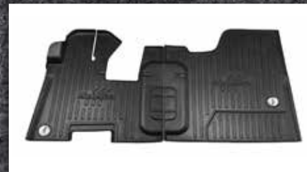
Figure 10 - Floor Mat Kit 105039