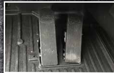
Figure 14 - Driver Mat Installed with Hook

12. Pull on the driver mat to confirm that the hook is fully engaged in the mat. If the hook is not functioning properly or the mat cannot be securely installed, do not use a Minimizer floor mat on the driver side of the vehicle.