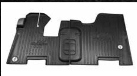
Figure 4 - Floor Mat Kit 105037