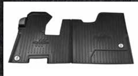
Figure 6 - Floor Mat Kit 105038