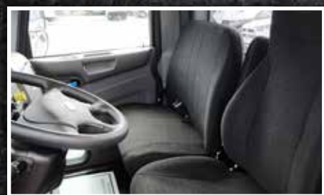
Figure 7 - Two-Man Bench Seat