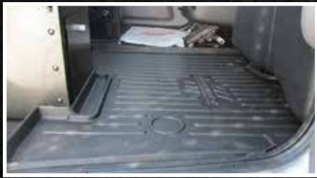
Figure 2 - Passenger Seat with Storage Compartment