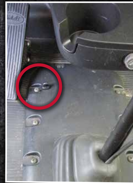
Figure 15 - Brake-Pedal Mounting Bolt

17. Prior to operating the vehicle, read the Safety Instructions for Vehicle Operation.