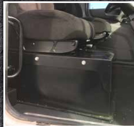
Figure 8 - Battery Box Passenger Seat Base