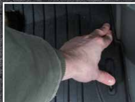
Figure 6 - Apply Pressure to Hook

17. For optimal adhesion do not disturb the hook for a period of 20 minutes after installation. Figure 7 below shows the properly installed driver mat and hook.