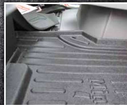
Figure 9 - Passenger Mat Retention Hook Location

23. Prior to operating the vehicle, read the Safety Instructions for Vehicle Operation.