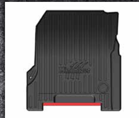
Figure 8 - Passenger Mat Trimming Diagram

22. Install the passenger mat retention hook as shown in Figure 9. Repeat steps 9-16 above to properly attach the hook to the plastic molding near the floor of the truck.