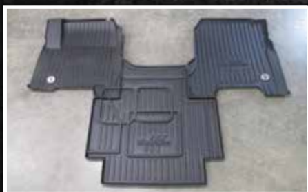
Figure 1 - Floor Mat Kit #104245