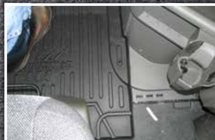
Figure 7 - Driver Mat Hook Installation

18. Pull the driver mat toward the rear of the truck to confirm that the hook is fully engaged into the mat and that the hook is adhered to the molding. If the hook is not functioning properly or the mat cannot be securely installed, do not use a Minimizer floor mat on the driver side of the vehicle.