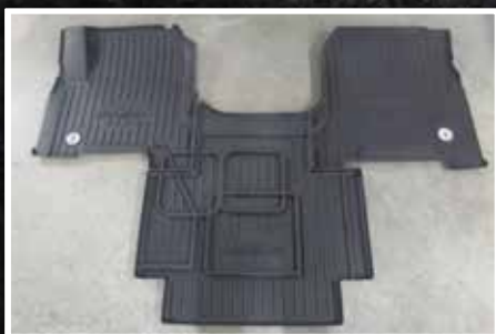
Figure 2 - Floor Mat Kit #104246