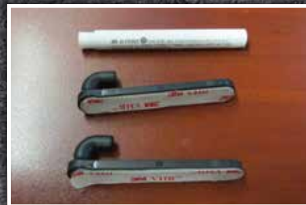
Figure 5 - Retention Hook and Primer 94

8. Insert one hook through the hole at the right edge of the driver mat. The hook should fit flush with the underside of the driver mat.