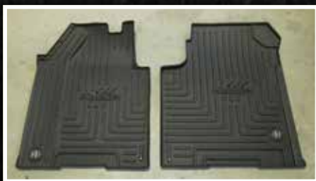
Figure 4 - Kit 103083 Contents

• Kit 103084 shown in Figure 5 is compatible with Western Star 5700XE 2016-2018 and Western Star 4700SB and 4700SF trucks equipped with a Cummins Engine and no driver side electrical tray 2016-2019. See figure 6 below for visual of electrical tray.