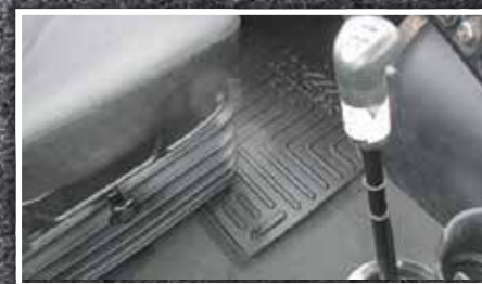
Figure 13 - Driver Mat Hook in Position

9. Mark the approximate position where the hook needs to be attached to the floor. Once the position is located, remove the driver mat from the truck.