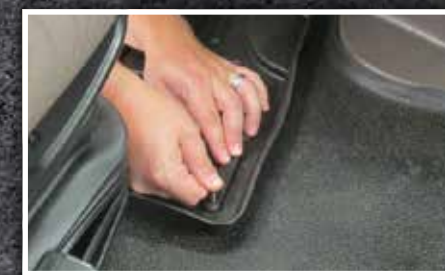
Figure 14 - Apply Pressure to Hook

15. Position the passenger floor mat in the truck. Make sure the passenger mat is pushed all the way forward so the outside lip makes full contact with the doghouse trim panel and fire wall as shown in Figure 15.