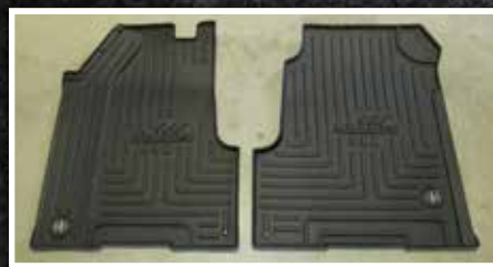
Figure 7 - Kit 103085 Contents

• Kit 103086 shown in Figure 8 is compatible with Western Star 4700SB and 4700SF trucks equipped with a DD13 Engine and no driver side electrical tray 2016-2019.