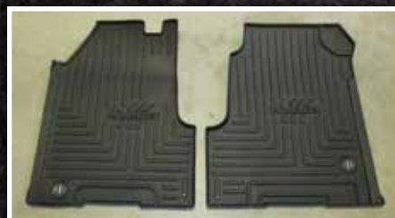
Figure 8 - Kit 103086 Contents

• Kit 103086 shown in Figure 8 is compatible with Western Star 4700SB and 4700SF trucks equipped with a DD13 Engine and no driver side electrical tray 2016-2019.