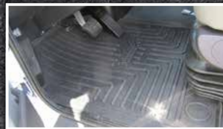
Figure 9 - Driver Mat in Position

Notes: The driver mat is designed to fit several common OEM seat bases. Truck seats that are equipped with a large rubber boot around the seat suspension (as shown in Figure 10) will require hand trimming at the time of installation. Some other aftermarket seats may also require hand trimming for proper fit. There is a raised rib molded into the driver mat to use as a trim guide and to contain liquid. Use a sharp utility knife to trim the mat as shown in Figure 11.