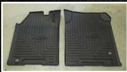
Figure 3 - Kit 103082 Contents

• Kit 103083 shown in Figure 4 is compatible with Western Star 4700SB and 4700SF trucks equipped with a Cummins Engine and driver side electrical tray 2016-2019.