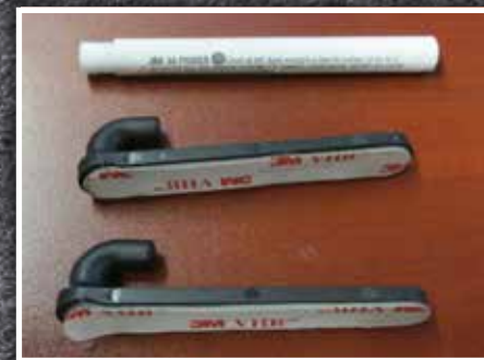
Figure 12 - Retention Hooks and Primer 94

7. Insert a hook up through the hole in the right rear corner of the driver side floor mat. The hook should fit flush with the underside of the floor mat.