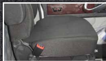
Figure 11 - Hand Trimming for Seat with Rubber Boot