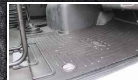
Figure 15 - Passenger Mat in Position

Note: The passenger floor mat is designed to accommodate both fixed seats and suspension seats. Trucks that are equipped with a fixed base passenger seat as shown in Figure 10 will need to be hand trimmed prior to installation. See figure 16 below that shows the green and orange shaded areas. Aftermarket seats may also require hand trimming. There are two raised ribs molded into the passenger mat to act as trim guides. To confirm which line to trim along test fit the mat against the seat base. Use a sharp utility knife to trim along the outside edge of the rib. Preserve the rib for liquid containment.