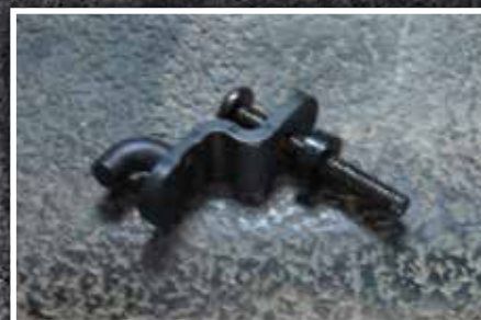
Figure 6 - Hook and Spacer Assembly

c) Insert the hook assembly through the transmission cover and tighten using a #3 Phillips screwdriver. Orient the floor mat hook so it points straight toward the gearshift as shown in Figure 7.