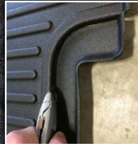
Figure 8 - Trimming for Aftermarket Seats

10. Pull the driver side floor mat to the left to confirm that the retention hook is fully engaged and securely fastened to the floor. If the hook is not functioning properly or the mat cannot be securely installed, do not use a Minimizer floor mat on the driver side of the vehicle.