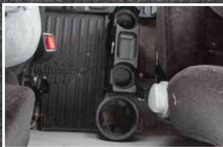
Figure 3 - Factory Thermos Holder

6. For cases where a fire extinguisher is mounted behind the driver seat, the left rear corner of the center mat shaded in yellow may be trimmed to allow for clearance.