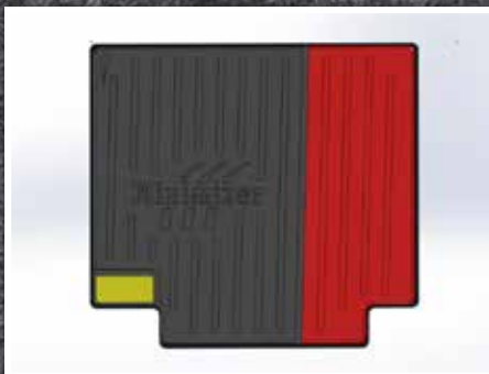
Figure 4 - Trimming Diagram

7. Next install the mat for the passenger side of the vehicle.