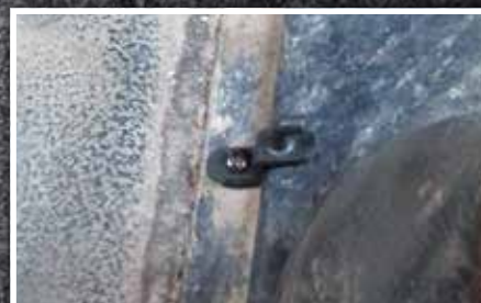
Figure 7 - Proper Hook Orientation

9. Install the driver side floor mat and engage it into the retention hook. If the position of the seat base is nonstandard or the truck is equipped with aftermarket seats it may be necessary to trim the rear portion of the driver or passenger mat to fit. There is a raised rib molded into the driver and passenger mat to contain liquids and act as a trim guide. Use a sharp utility knife as shown in Figure 8 to trim the material and cut along the outside of raised rib preserving the rib for liquid containment.