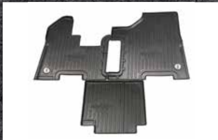
Figure 2 - KIT FKP6B Contents

Trucks equipped with a factory thermos holder require hand trimming of the center mat. A raised trim line is molded into the floor mat to use as a guide and for liquid containment.