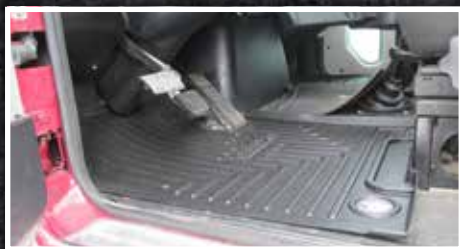
Figure 4 - Driver Mat Position

• The driver mat must be pushed all the way forward so the front lip is making full contact with the doghouse trim panel and fire wall.