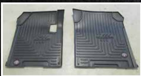
Figure 1 - FKSTAR1B Contents

• Kit FKWS2B is compatible with 2012-2016 Western Star 4900SA, 4900FA, 4900SF, 4900SB.