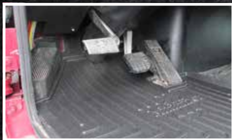
Figure 6 - Driver Side Electrical Enclosure & Floor Mat

• The driver mat is designed to fit the most common OEM seats. Trucks that are equipped with non-standard aftermarket seats may require hand trimming at the time of installation. If needed there is a raised rib molded into the driver mat to use as a trim guide. The area shaded blue shown in Figure 7 is the portion to be removed. Use a sharp utility knife to remove this portion.