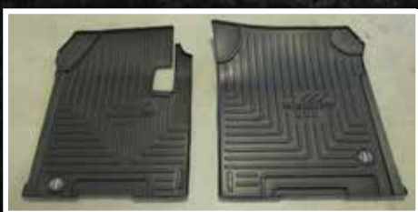
Figure 3 - FKSTAR3B Contents

* FKSTAR3B passenger mat requires hand trimming. Refer to installation step 15 for details.