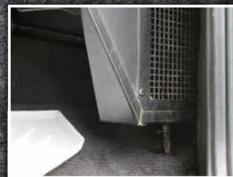
Figure 11 - High Capacity HVAC Unit

• For Western Star models 4900SA, 4900FA, 4900SB, 4900SF years 1998 - 2011 the yellow shaded area shown in Figure 12 will likely need to be hand trimmed along the raised rib at the time of installation. Test fit the mat before trimming to confirm.