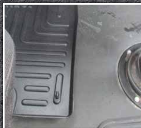
Figure 9 - Driver Mat Hook Installation

9. Unpack the tube of Primer 94 and read the safety precautions printed on the tube.