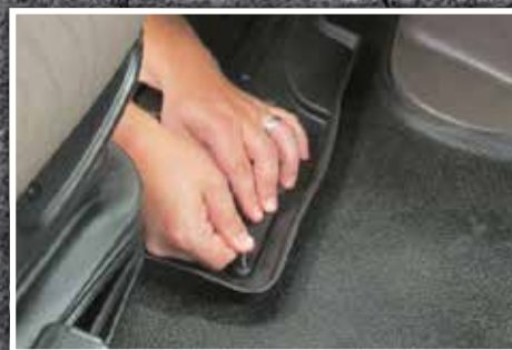
Figure 10 - Apply Pressure to Hook

15. Position the passenger mat in the truck. Make sure the passenger mat is pushed all the way forward so the outside lip makes full contact with the doghouse trim panel and fire wall.