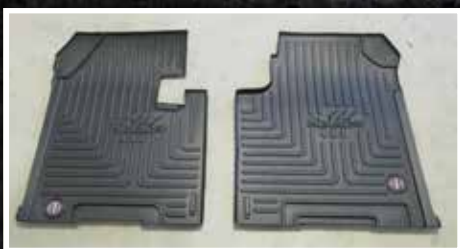
Figure 2 - FKSTAR2B Contents

• Kit FKWS3B is compatible with Western Star 4900SA, 4900FA 1998-2011