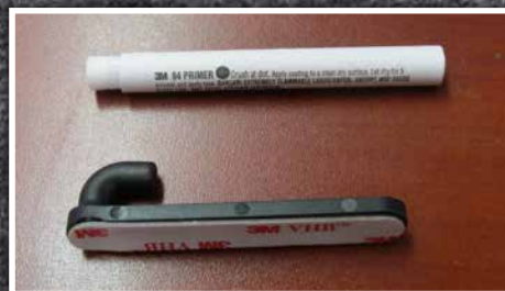
Figure 8 - Hook and Primer 94

7. Insert hook up through the hole in the right rear corner of the driver side floor mat. The hook should fit flush with the underside of the floor mat.