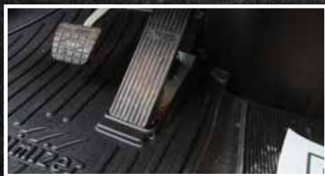
Figure 5 - FKSTAR3B Driver Mat Installation

• In some cases a steel or plastic electrical enclosure will be mounted on the floor area in the left front corner of the cab as shown in Figure 6. If the electrical enclosure is present, the left front portion of the driver mat will need to be hand trimmed along the raised rib. The area to trim is shaded red in Figure 7.