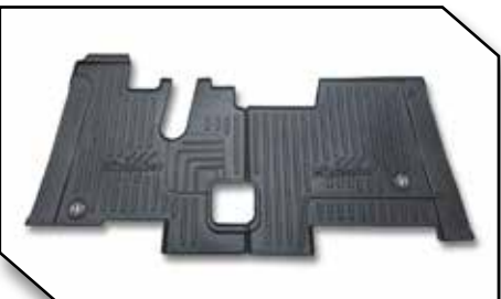
Figure 4 – Floor Mat Kit #100889