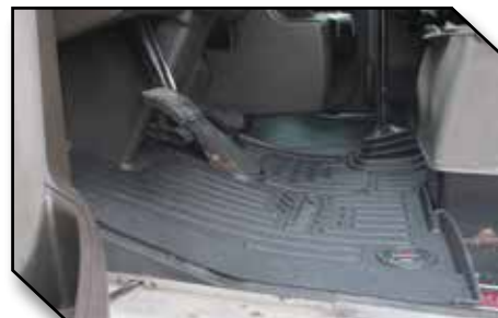
Figure 7 – Driver Mat Fit