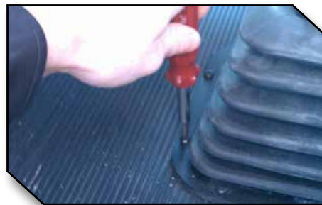
Figure 8 – Remove Screw from Shifter Boot