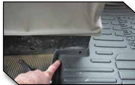
Figure 10 – Driver Mat Hook Location