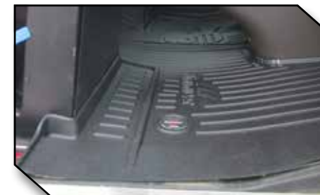
Figure 13 – Passenger Mat Fit