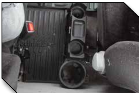
Figure 3 - Factory Thermos Holder

6. For cases where a fire extinguisher is mounted behind the driver seat, the left rear corner of the center mat shaded in yellow may be trimmed to allow for clearance.