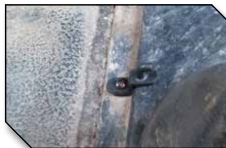
Figure 7 - Proper Hook Orientation

9. Install the driver side floor mat and engage it into the retention hook. If the position of the seat base is nonstandard or the truck is equipped with aftermarket seats it may be necessary to trim the rear portion of the driver or passenger mat to fit. There is a raised rib molded into the driver and passenger mat to contain liquids and act as a trim guide. Use a sharp utility knife as shown in Figure 8 to trim the material and cut along the outside of raised rib preserving the rib for liquid containment.