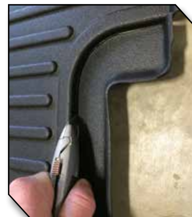
Figure 8 - Trimming for Aftermarket Seats

10. Pull the driver side floor mat to the left to confirm that the retention hook is fully engaged and securely fastened to the floor. If the hook is not functioning properly or the mat cannot be securely installed, do not use a Minimizer floor mat on the driver side of the vehicle.