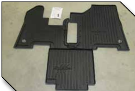
Figure 1 - KIT FKP5B Contents

Kit FKP6B shown in Figure 2 is compatible with Peterbilt 357, 377, 378, 379, 385 trucks built prior to 5/2004.