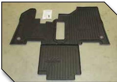
Figure 2 - KIT FKP6B Contents

Trucks equipped with a factory thermos holder require hand trimming of the center mat. A raised trim line is molded into the floor mat to use as a guide and for liquid containment.