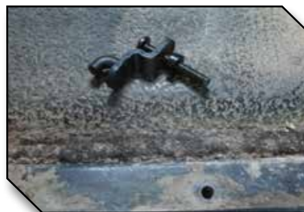
Figure 6 - Hook and Spacer Assembly

c) Insert the hook assembly through the transmission cover and tighten using a #3 Phillips screwdriver. Orient the floor mat hook so it points straight toward the gearshift as shown in Figure 7.