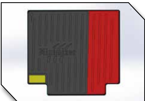
Figure 4 - Trimming Diagram

7. Next install the mat for the passenger side of the vehicle.