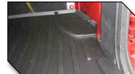
Figure 14 - Fixed Base Passenger Seat with Trimmed Mat

17. Confirm that the retention hook is fully engaged into the driver mat and that the hook is adhered to the floor. If the driver mat hook is not functioning properly or the mat cannot be securely installed, do not use a Minimizer floor mat on the driver side of the vehicle.