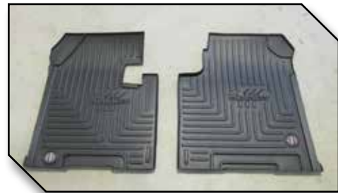
Figure 2 - FKSTAR2B Contents

• Kit FKWS3B is compatible with Western Star 4900SA, 4900FA 1998-2011