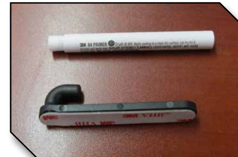
Figure 8 - Hook and Primer 94

7. Insert hook up through the hole in the right rear corner of the driver side floor mat. The hook should fit flush with the underside of the floor mat.