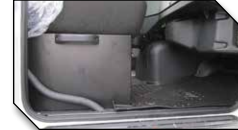
Figure 13 - Fixed Passenger Seat (Hand Trimming Required)

16. Once the passenger mat is in position, install the passenger mat hook. For trucks with rubber floors use the same process listed in steps 7-15 above. For trucks with carpeted floors install the hook at the right front corner of the passenger side area as shown in Figure 14. There is a small oval shaped trim line visible on the outside perimeter of the mat where the hook opening should be trimmed. Follow the same basic steps to prime the steel surface and attach the hook to the cab.