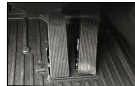
Figure 14 - Driver Mat Installed with Hook