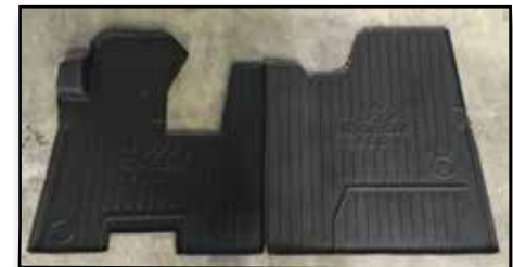
Figure 6 - Floor Mat Kit 105038