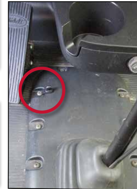
Figure 15 - Brake-Pedal Mounting Bolt