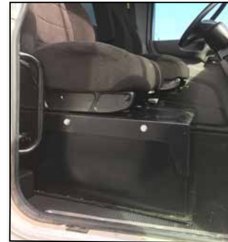
Figure 8 - Battery Box Passenger Seat Base