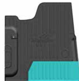
Figure 9 - Trimming Diagram