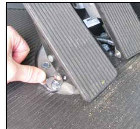
Figure 12 - Brake-Pedal Mounting Bolt