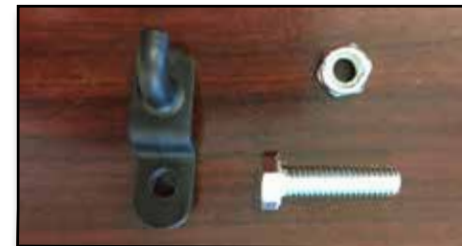
Figure 11 - Retention Hook & Hardware