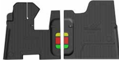
Figure 5 - Trimming Diagram