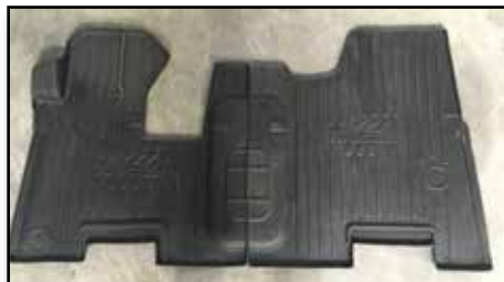
Figure 4 - Floor Mat Kit 105037