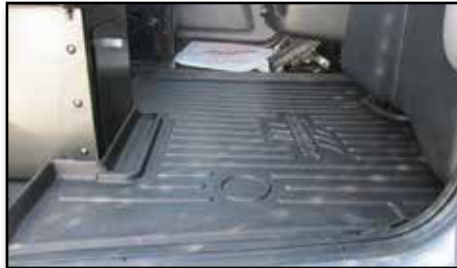
Figure 2 - Passenger Seat with Storage Compartment