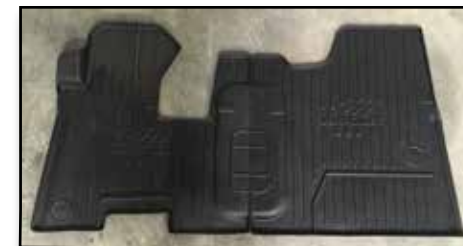
Figure 10 - Floor Mat Kit 105039