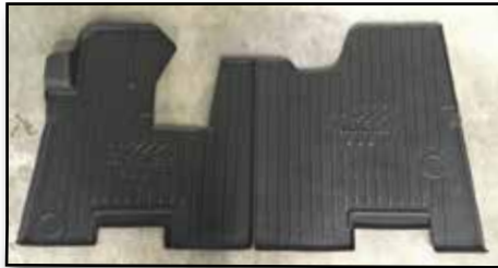
Figure 1 - Floor Mat Kit 105036