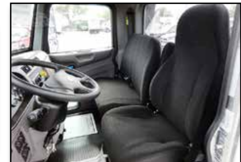
Figure 7 - Two-Man Bench Seat