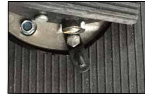
Figure 13 - Retention Hook & Hardware