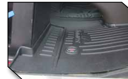
Figure 13 – Passenger Mat Fit