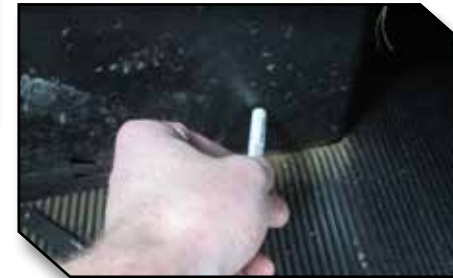
Figure 11 – Apply Primer to Seat Base