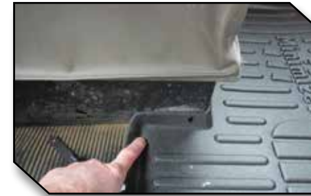
Figure 10 – Driver Mat Hook Location