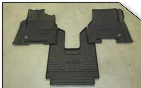
Figure 1 - Kit FKFRTL3MB Contents