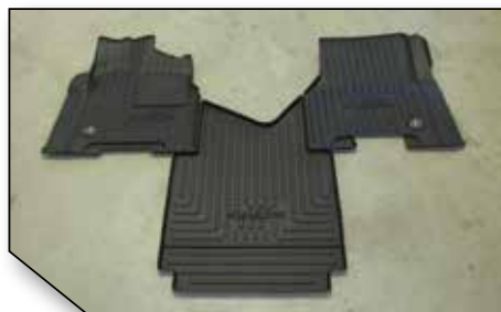
Figure 2 - Kit FKFRTL3AB Contents