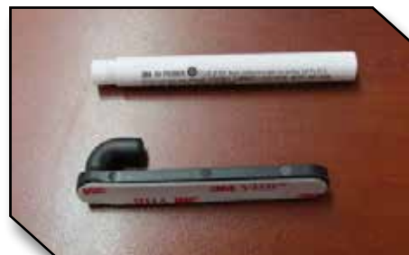
Figure 8 - Retention Hook and Primer 94

9. Insert the hook through the hole at the right edge of the driver mat as shown in Figure 9. The hook should fit flush with the underside of the driver mat.