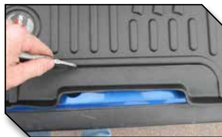
Figure 7 – Driver Mat Trim for Installation With Ezy Rider Seat or Aftermarket Seat.

8. Inside the package with the installation instructions, locate a black plastic retention hook as well as a white tube of Primer 94 as shown in Figure 8.