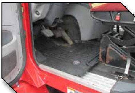
Figure 6 - Driver Mat Fit with OEM Seat Base

Note: When installing in trucks equipped with an EzyRider driver seat the floor mat material behind the raised rib will need to be trimmed away with a utility knife as shown in Figure