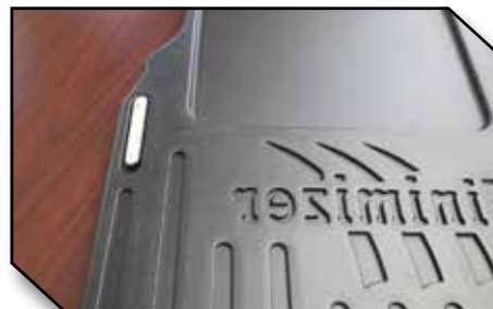
Figure 9 - Hook Inserted in Driver Mat

10. Once the hook is in place, let the driver mat and hook rest on the truck floor.