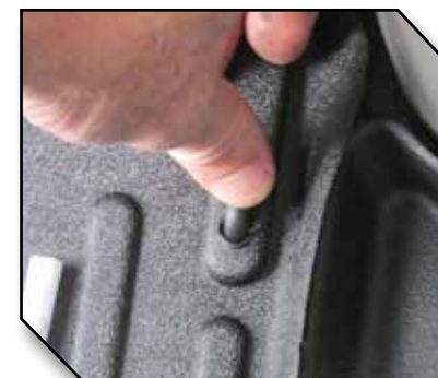
Figure 10 - Apply Pressure to the Hook

18. For optimal adhesion do not disturb the retention hook for a period of 20 minutes after installation. Figure 11 below shows the properly installed driver mat and hook.