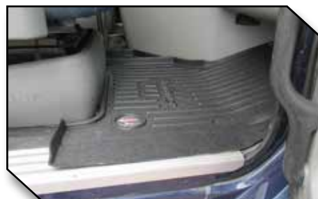
Figure 5 - Passenger Mat Trimmed and Installed with EzyRider Seat

7. Test fit the driver mat in the truck. The driver mat is designed to fit underneath the throttle pedal. To install the driver mat, lift up the heel portion of the throttle pedal and slide the front of the floor mat underneath the pedal. Confirm that the mat is pushed all the way forward so it rests against the fire wall. Figure 6 below shows the driver mat installed in a truck with an OEM seat.