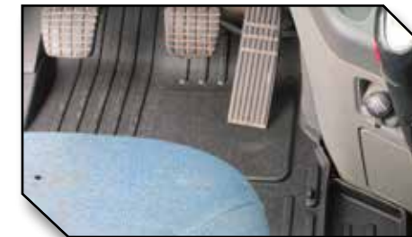
Figure 11 - Properly Installed Driver Mat and Hook

19. Pull the driver mat toward the rear of the truck to confirm that the hook is fully engaged into the mat and that the hook is adhered to the floor. If the hook is not functioning properly or the mat cannot be securely installed, do not use a Minimizer floor mat on the driver side of the vehicle.