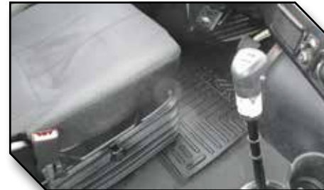
Figure 13 - Driver Mat Hook in Position