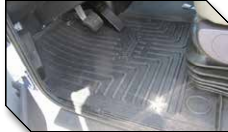
Figure 9 - Driver Mat in Position

Notes: The driver mat is designed to fit several common OEM seat bases. Truck seats that are equipped with a large rubber boot around the seat suspension (as shown in Figure 10) will require hand trimming at the time of installation. Some other aftermarket seats may also require hand trimming for proper fit. There is a raised rib molded into the driver mat to use as a trim guide and to contain liquid. Use a sharp utility knife to trim the mat as shown in Figure 11.