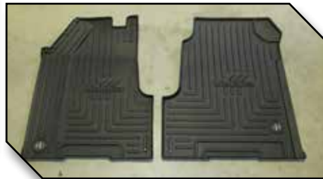
Figure 7 - Kit 103085 Contents

• Kit 103086 shown in Figure 8 is compatible with Western Star 4700SB and 4700SF trucks equipped with a DD13 Engine and no driver side electrical tray 2016-2019.