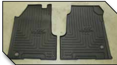
Figure 8 - Kit 103086 Contents

• Kit 103086 shown in Figure 8 is compatible with Western Star 4700SB and 4700SF trucks equipped with a DD13 Engine and no driver side electrical tray 2016-2019.