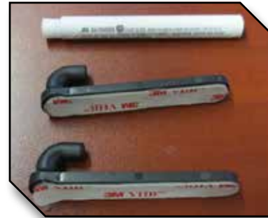
Figure 12 - Retention Hooks and Primer 94