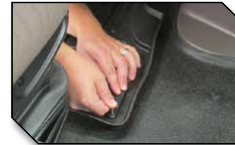
Figure 14 - Apply Pressure to Hook