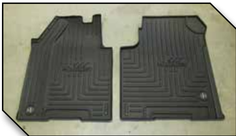
Figure 4 - Kit 103083 Contents

• Kit 103084 shown in Figure 5 is compatible with Western Star 5700XE 2016-2018 and Western Star 4700SB and 4700SF trucks equipped with a Cummins Engine and no driver side electrical tray 2016-2019. See figure 6 below for description of electrical tray.