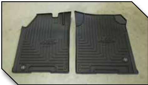
Figure 3 - Kit 103082 Contents

• Kit 103083 shown in Figure 4 is compatible with Western Star 4700SB and 4700SF trucks equipped with a Cummins Engine and driver side electrical tray 2016-2019.