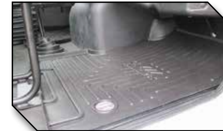
Figure 15 - Passenger Mat in Position

Note: The passenger floor mat is designed to accommodate both fixed seats and suspension seats. Trucks that are equipped with a fixed base passenger seat as shown in Figure 10 will need to be hand trimmed prior to installation. See figure 16 below that shows the green and orange shaded areas. Aftermarket seats may also require hand trimming. There are two raised ribs molded into the passenger mat to act as trim guides. To confirm which line to trim along test fit the mat against the seat base. Use a sharp utility knife to trim along the outside edge of the rib. Preserve the rib for liquid containment.