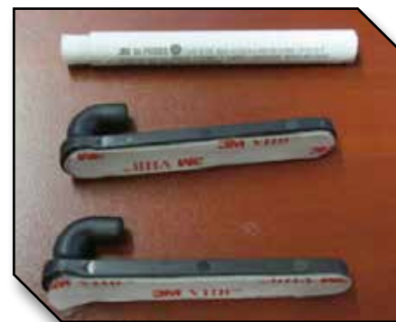
Figure 6 - Driver Side Electrical Enclosure & Floor Mat

7. Install the center mat in the truck and verify fit. In some cases the center mat will need to be trimmed on the left side to allow for a driver seat with a large base plate. Specifically, trimming is required when using with the "Minimizer Long Haul Series seat". There is a raised rib molded into the center mat that is designed to be used as trim guide. The area shaded in blue on Figure 7 below is the area to be trimmed.