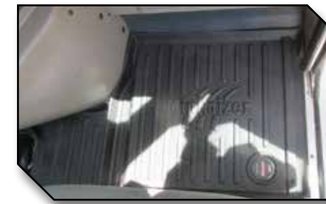
Figure 10 - Passenger Mat in Position

16. Position the passenger floor mat in the truck. Make sure the passenger mat is pushed all the way forward so the outside lip makes full contact with the doghouse trim panel and fire wall as shown in Figure 10.