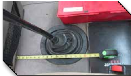
Figure 3 - Distance Measured from Doghouse to Gearshift