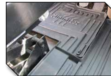
Figure 9 - Driver Mat Hook in Position

Mark the approximate position where the hook needs to be attached to the floor. Once the position is located, remove the driver mat from the truck.