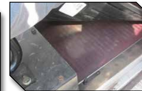
Figure 11 - Passenger Mat Hook in Position

18. Confirm that the retention hook is fully engaged into the driver mat and that the hook is adhered to the floor. If the driver mat retention hook is not functioning properly or the mat cannot be securely installed, do not use a Minimizer floor mat on the driver side of the vehicle.