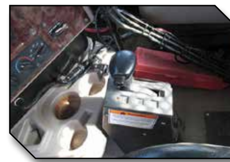
Figure 8 - Floor Mounted Control Tower

8. Insert a hook up through the hole in the right rear corner of the driver side floor mat. The hook should fit flush with the underside of the floor mat.