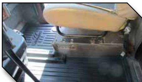
Figure 1 - Premium Interior (No Cup Holder)