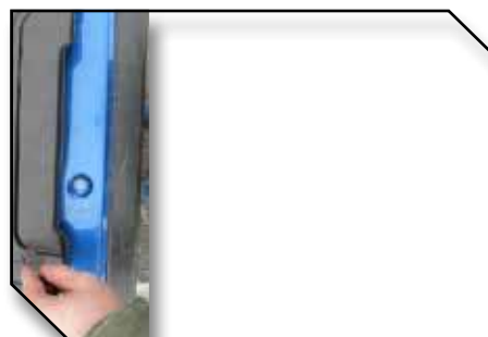
Figure 6 - Hook and Spacer Assembly

c) Insert the hook assembly through the transmission cover and tighten using a #3 Phillips screwdriver. Orient the floor mat hook so it points straight toward the gearshift as shown in Figure 7.