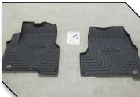
Figure 2 - KIT FKPB6B Contents

• Trucks equipped with a factory thermos holder require hand trimming of the center mat. A raised trim line is molded into the floor mat to use as a guide and for liquid containment.