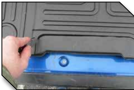
Figure 3 - Factory Thermos Holder

6. For cases where a fire extinguisher is mounted behind the driver seat, the left rear corner of the center mat shaded in yellow may be trimmed to allow for clearance.