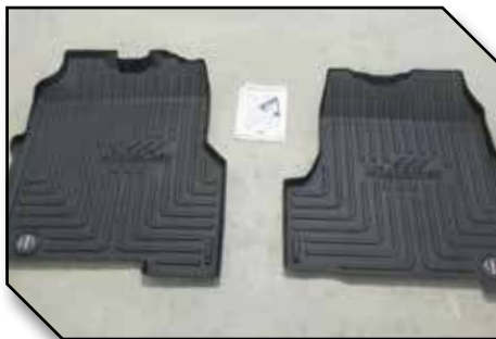
Figure 1 - KIT FKPB5B Contents

• Kit FKPB6B shown in Figure 2 is compatible with Peterbilt 357, 377, 378, 379, 385 trucks built prior to 5/2004.