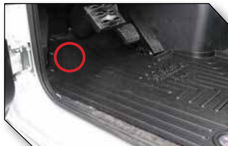
Figure 5 - Mounting Screw Identification

b) Locate the retention hook, 1/4" machine screw, and poly spacer shown in Figure 6. Insert the screw through the hole in the retention hook and place the black poly spacer on the bolt below the hook.