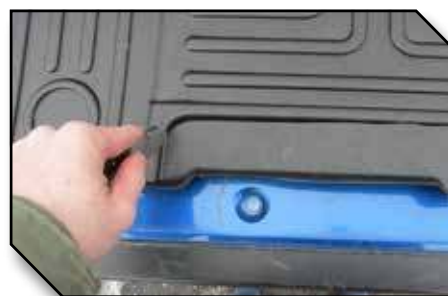
Figure 7 - Proper Hook Orientation

9. Install the driver side floor mat and engage it into the retention hook. If the position of the seat base is nonstandard or the truck is equipped with aftermarket seats it may be necessary to trim the rear portion of the driver or passenger mat to fit. There is a raised rib molded into the driver and passenger mat to contain liquids and act as a trim guide. Use a sharp utility knife as shown in Figure 8 to trim the material and cut along the outside of raised rib preserving the rib for liquid containment.