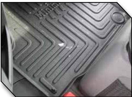
Figure 4 - Trimming Diagram

7. Next install the mat for the passenger side of the vehicle.