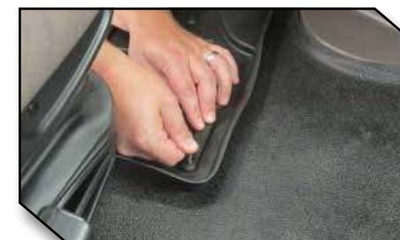
Figure 11 - Apply Pressure to Hook

18. For optimal adhesion do not disturb the hook for a period of 20 minutes after installation. Figure 12 below shows the proper installation of the hook.