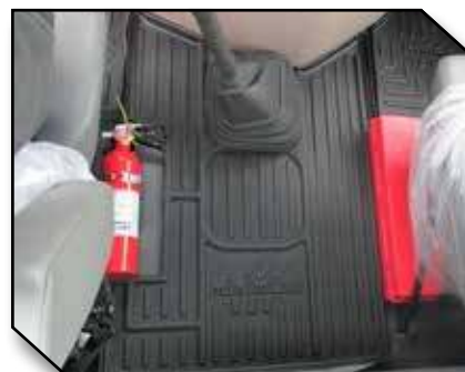
Figure 5 – Trimmed Center Mat Installed

6. Straighten the rubber boot that surrounds the gear shift so it rests smoothly on top of the center mat as shown below in Figure 6.