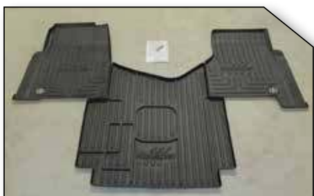
Figure 1 – Kit FKFRTLASCAB Contents