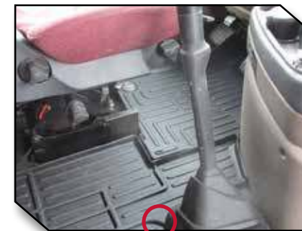
Figure 10 – Confirm Location Driver Mat and Hook

11. Mark the approximate position where the hook will need to be attached to the floor with a finger. Once the position is located, remove the driver mat from the truck.