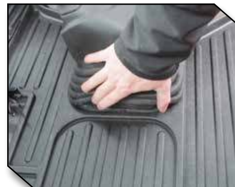
Figure 6 - Straightening Rubber Boot

7. Position the driver mat in the truck as shown in Figure 7.