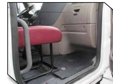
Figure 13 - Passenger Mat With Fixed Seat

20. Pull the driver mat toward the front of the truck to confirm that the hook is fully engaged into the mat and that the hook is adhered to the floor. If the hook is not functioning properly or the mat cannot be securely installed, do not use a Minimizer floor mat on the driver side of the vehicle.