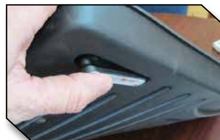
Figure 9 - Hook Insertion

10. Once the hook is in place, let the driver mat and hook rest on the floor as shown in Figure 10.