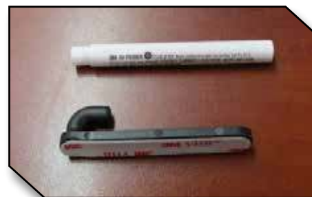
Figure 8 - Hook and Primer 94

9. Insert the hook up through the hole at the right rear corner of the driver mat as shown in Figure 9. The hook should fit flush with the underside of the driver mat.