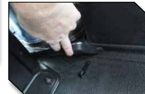
Figure 12 – Properly Installed Hook

18. For optimal adhesion do not disturb the hook for a period of 20 minutes after installation. Figure 12 below shows the proper installation of the hook.