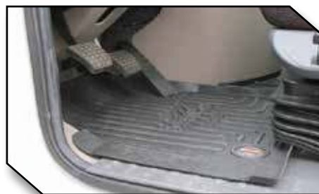
Figure 7 - Driver Mat in Position

8. Inside the package with the installation instructions, locate a black plastic retention hook as well as a white tube of Primer 94 as shown in Figure 8.