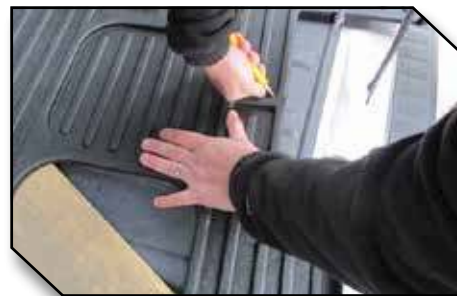
Figure 4 – Trimming With Utility Knife

Note: Figure 5 below shows the center mat from kit FKFRTLASCMB installed in a day cab truck. This mat was trimmed to fit around the existing fire extinguisher and DOT roadside safety kit.