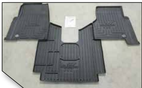
Figure 2 - Kit FKFRTLASCMB Contents