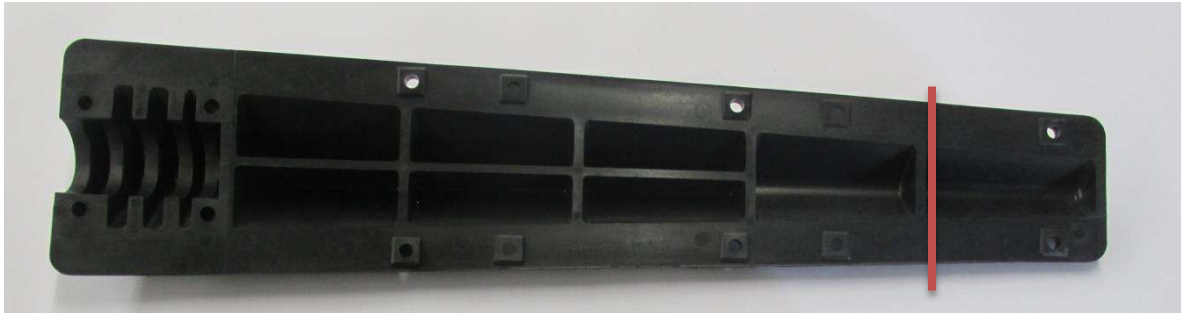
Figure 2 – Trimming Location