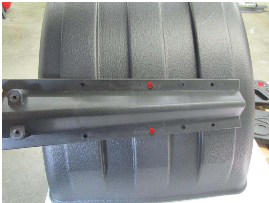
Figure 5 - Trimmed Bracket Aligned With MIN1600 Series Fender