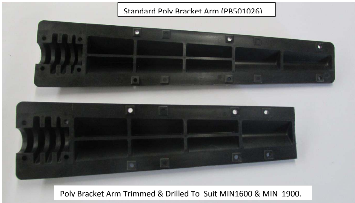
Figure 4 - Side by Side View of Standard Bracket and Trimmed Bracket